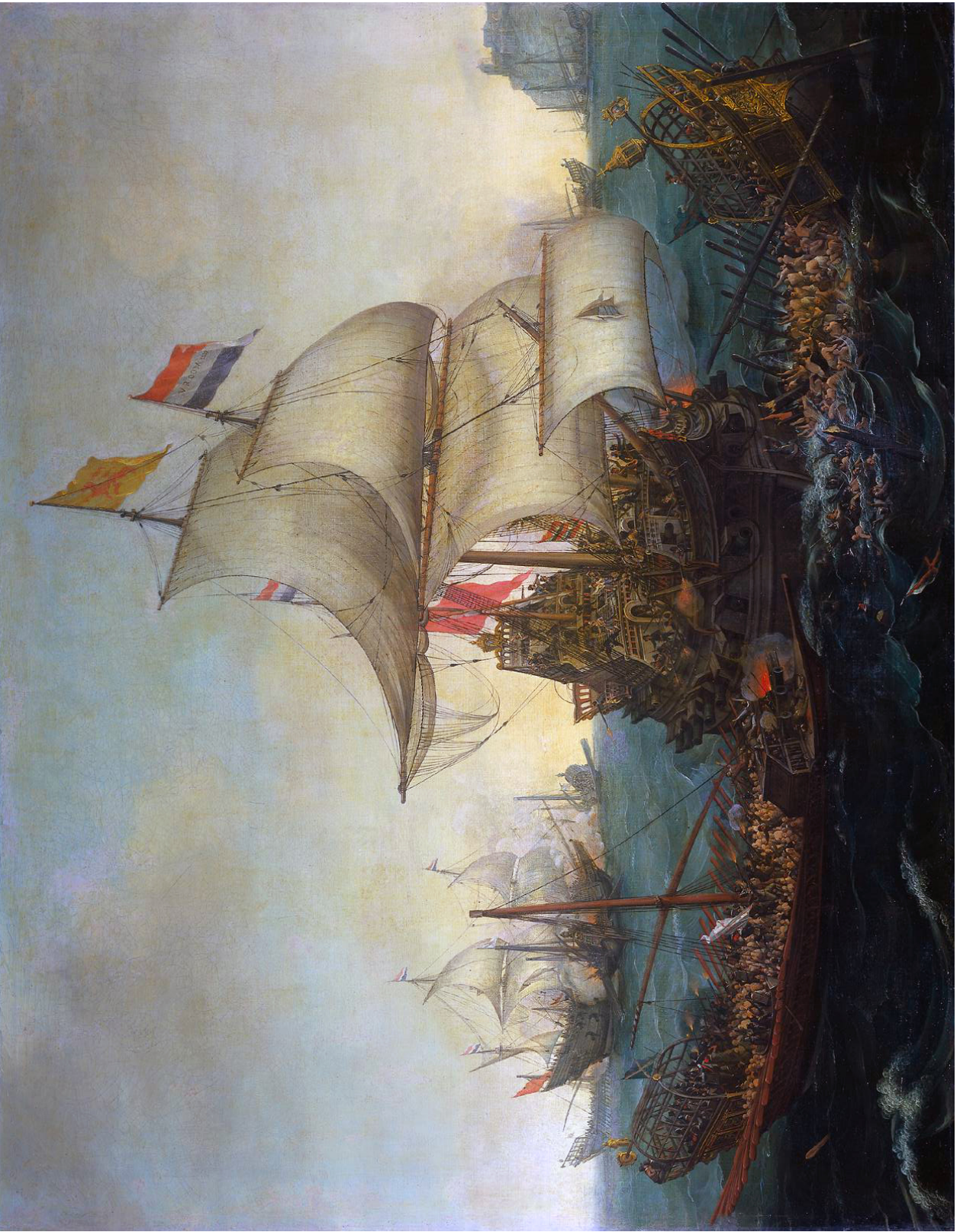
Figure A: Galleons versus galleys: Dutch Ships Ramming Spanish Galleys off the Flemish Coast in October 1602 by Hendrick Cornelisz Vroom, 1617.