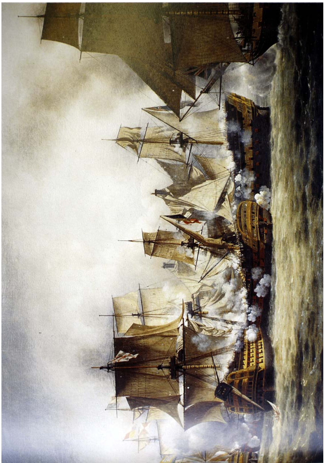
Figure C: The French Redoutable simultaneously engaged by Victory and Temeraire , with Tonnant taking position at stern during the Battle of Trafalgar. Louis-Philippe Crépin, 1807.