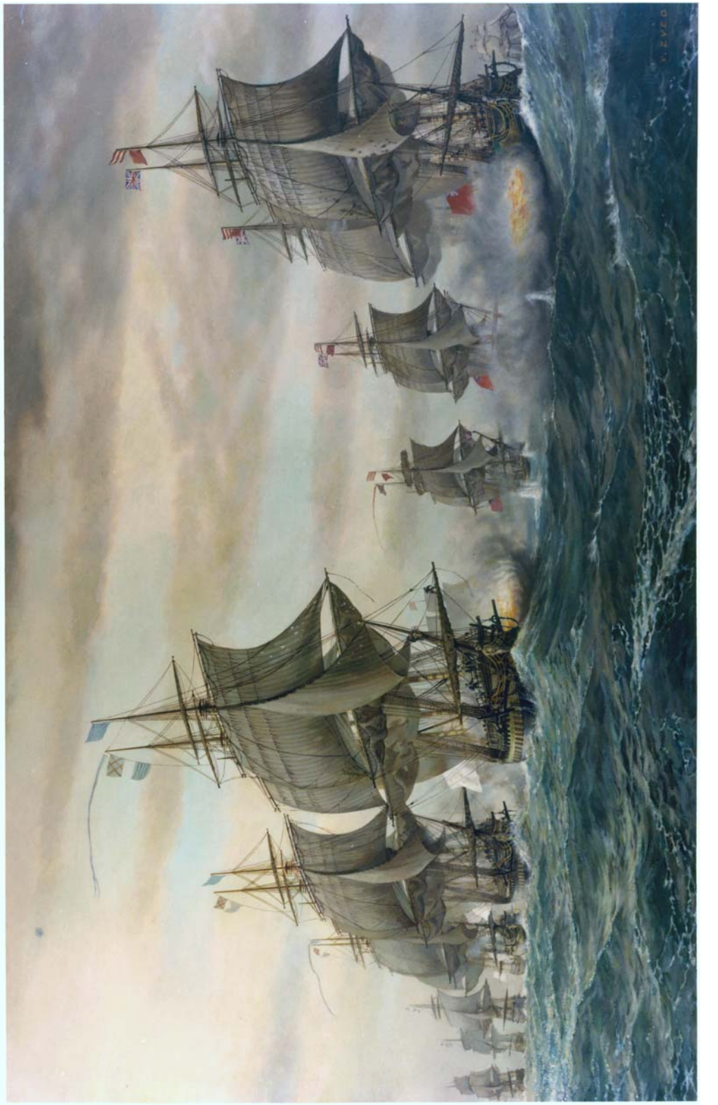
Figure D: The French and British lines during the Battle of the Capes during the American Revolutionary War, September 5, 1781 by V. Zveg (Wladimir Zveguintzoff), 1962.